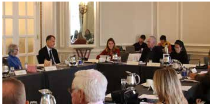
Chapter Leaders' Meeting Hall in Ottawa