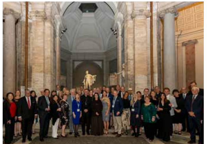
CA & NW Chapter in the Octagonal Courtyard before the gala dinner