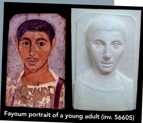
Fayoum portrait of a young adult (inv. 56605)