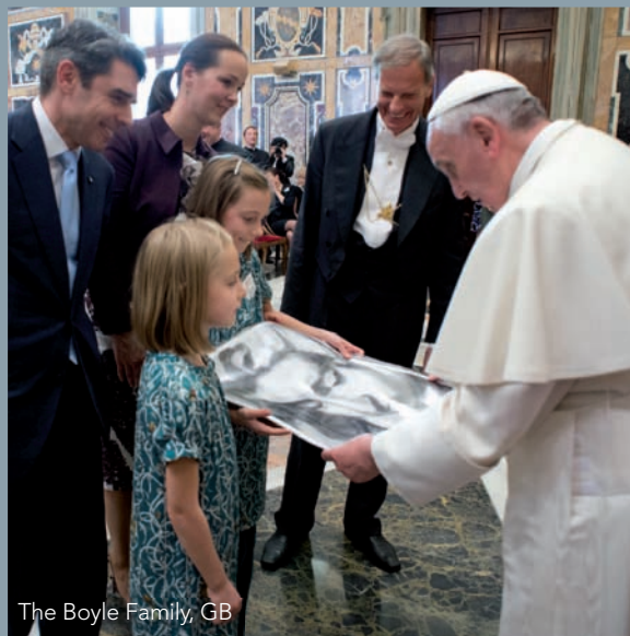
The Boyle Family, GB

Dear Friends, may your patronage of the arts in the Vatican Museums always be a sign of your interior participation in the spiritual life and mission of the Church. May it also be an expression of our hope in the coming of that Kingdom whose beauty, harmony, and peace are the expectation of every human heart and the inspiration of mankind's highest artistic aspirations. To you, your families and associates, I cordially impart my Apostolic Blessing as a pledge of enduring joy and peace in the Lord.